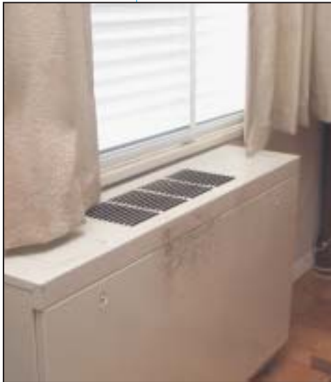
Mold growing on the surface of a unit ventilator.