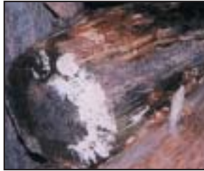
Mold growing outdoors on firewood. Molds come in many colors; both white and black molds are shown here.

is mold growing in my home? Molds are part of the natural environment. Outdoors, molds play a part in nature by breaking down dead organic matter such as fallen leaves and dead trees, but indoors, mold growth should be avoided. Molds reproduce by means of tiny spores; the spores are invisible to the naked eye and float through outdoor and indoor air. Mold may begin growing indoors when mold spores land on surfaces that are wet. There are many types of mold, and none of them will grow without water or moisture.