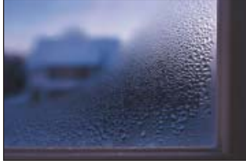
Condensation on the inside of a windowpane.

■ Keep indoor humidity low. If possible, keep indoor humidity below 60 percent (ideally between 30 and 50 percent) relative humidity. Relative humidity can be measured with a moisture or humidity meter, a small, inexpensive ($10-$50) instrument available at many hardware stores.